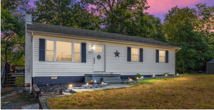
3574 HOWELLSVILLE RD FRONT ROYAL - $325K

Remodeled rancher in Shenandoah Farms with access to two lakes and the Shenandoah River! Featuring 3 bedrooms, a detached garage situated on just over an acre lot leaving plenty of room for water toys! Schedule a showing with us!