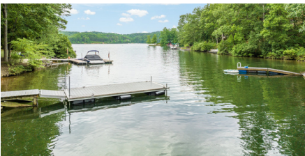
6197 OAKLAWN LN WOODBRIDGE - $560K